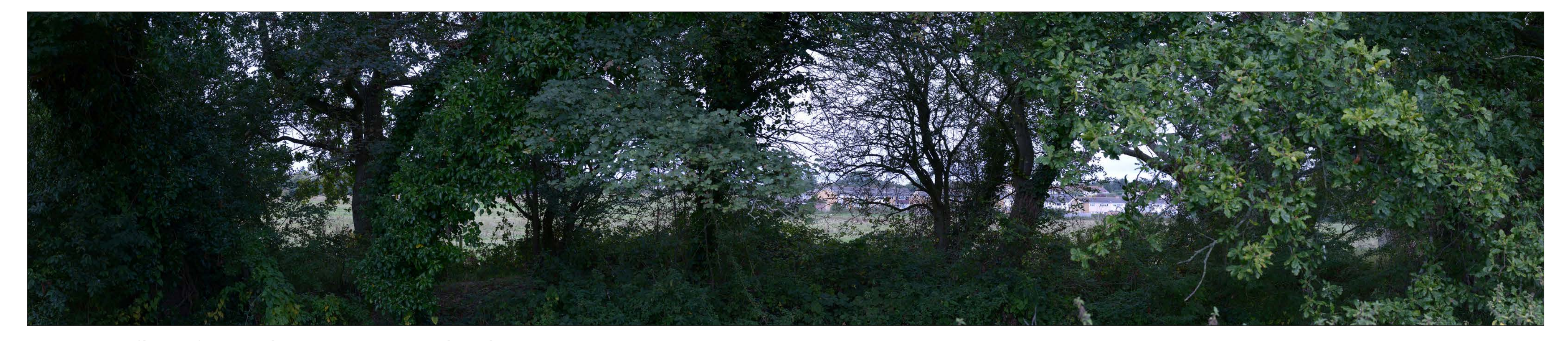
VIEWPOINT 10 (SUMMER): VIEW WEST FROM FOOTPATH 48, EAST OF SITE

The photographs within this sheet have been scaled to match the equivalent view of the human eye, when printed out at A2 and viewed at a distance of 300m