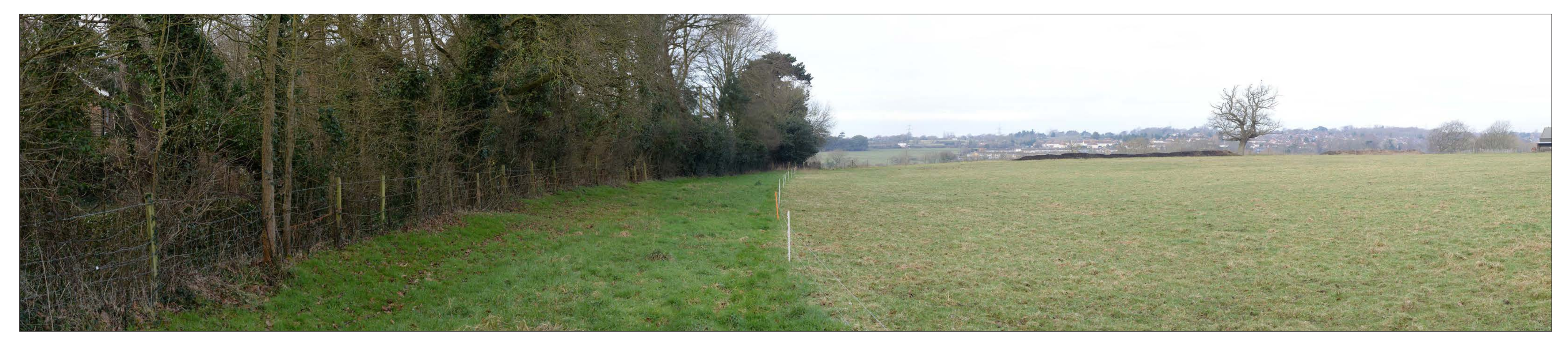
VIEWPOINT 12 (WINTER): VIEW WEST FROM FOOTPATH NORTH OF NEWGATE LANE ESTATE