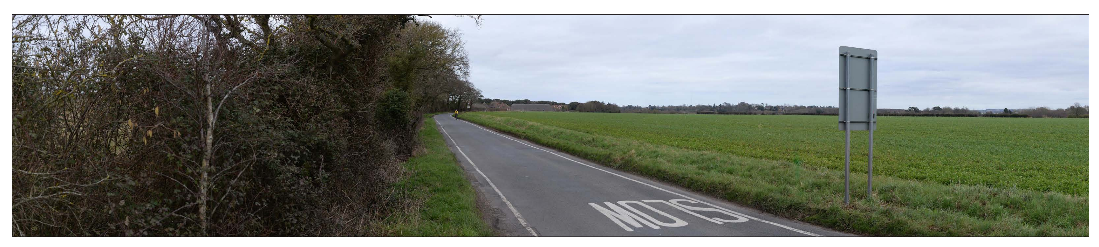
VIEWPOINT 6 (WINTER): VIEW NORTH OFF POSBROOK LANE NORTH OF SINGLEDGE HOUSE