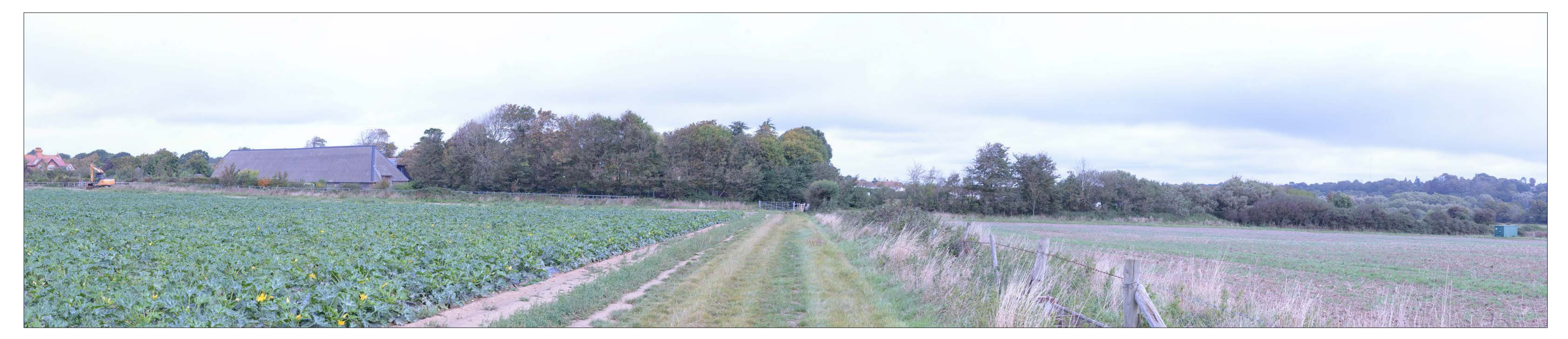
VIEWPOINT 7 (SUMMER): VIEW NORTH FROM FOOTPATH 34 SOUTH OF GREAT POSBROOKE FARM

The photographs within this sheet have been scaled to match the equivalent view of the human eye, when printed out at A2 and viewed at a distance of 300mm.