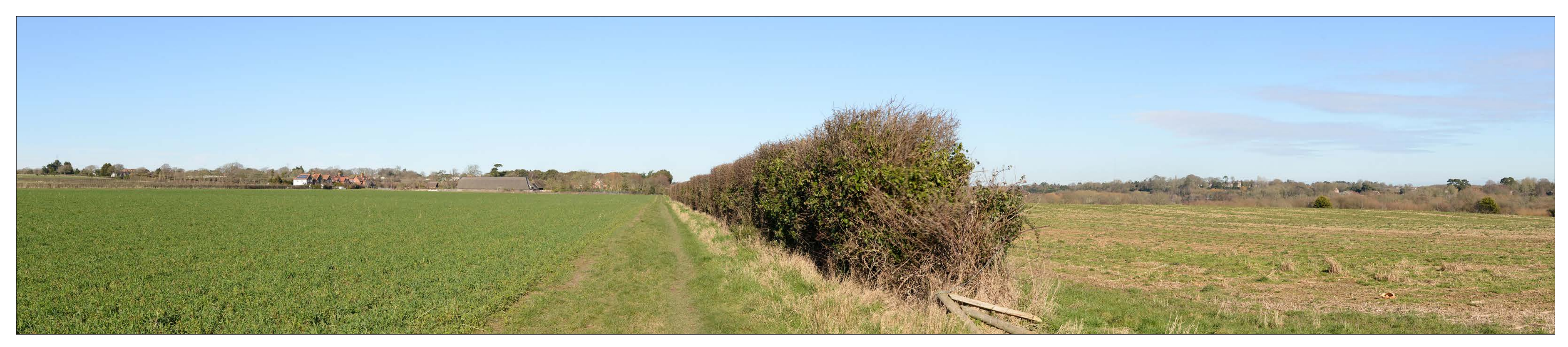
VIEWPOINT 8 (WINTER): VIEW NORTH FROM FOOTPATH 34 NORTH OF UPPER FARM