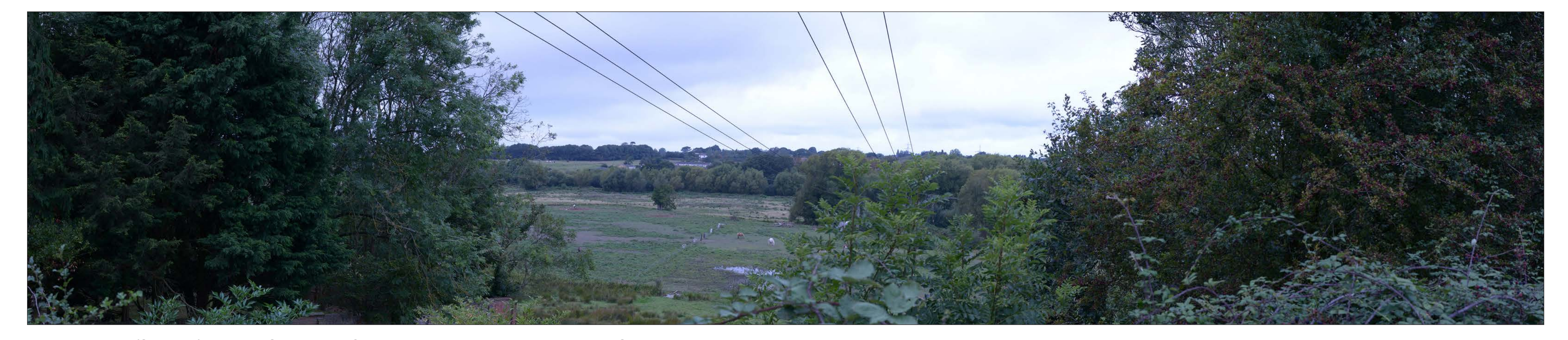
VIEWPOINT 11 (SUMMER): VIEW WEST FROM TITCHFIELD ROAD, NORTH OF HOLLAM HOUSE

The photographs within this sheet have been scaled to match the equivalent view of the human eye, when printed out at A2 and viewed at a distance of 300mm.