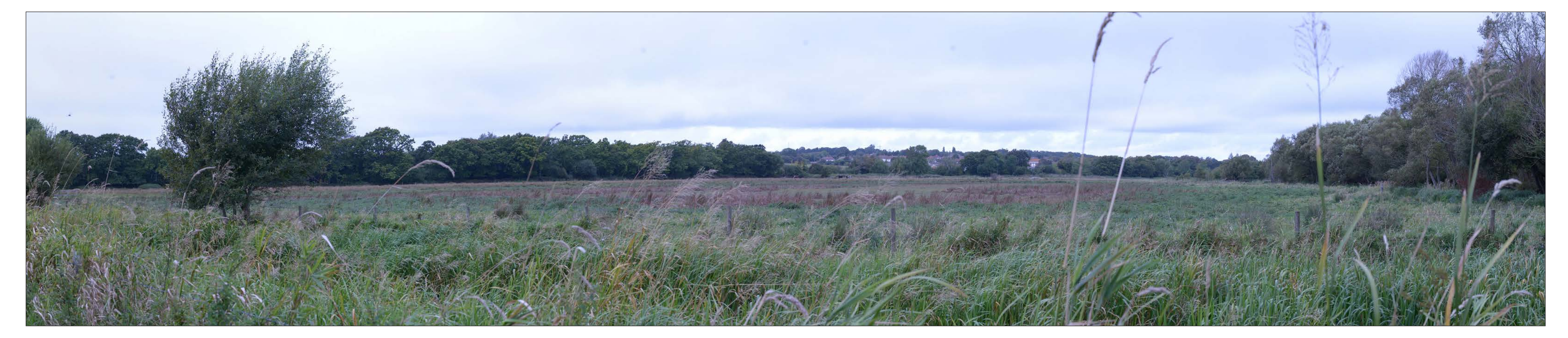
VIEWPOINT 13 (SUMMER): VIEW NORTH WEST FROM FOOTPATH CROSSING RIVER MEON, WITHIN NATIONAL NATURE RESERVE

The photographs within this sheet have been scaled to match the equivalent view of the human eye, when printed out at A2 and viewed at a distance of 300mm.