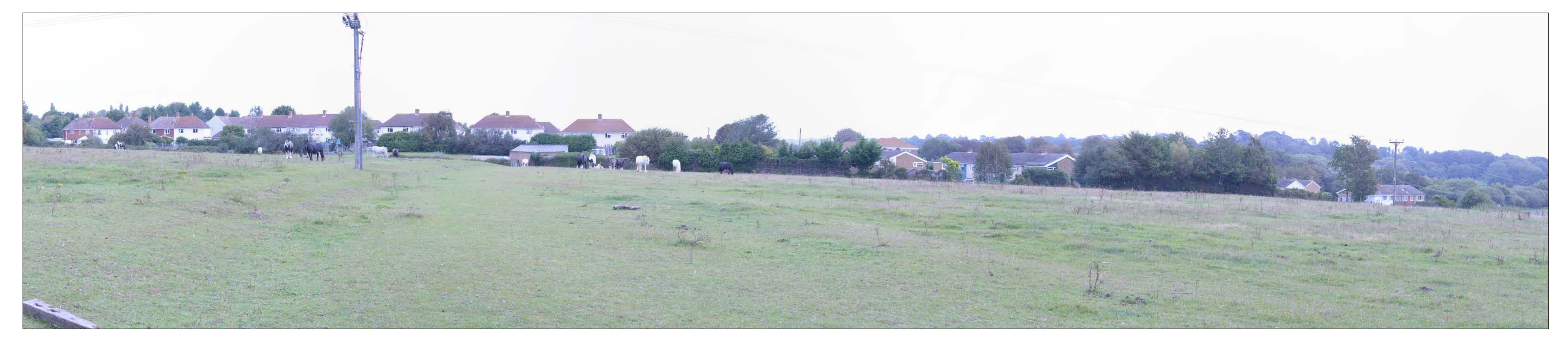
VIEWPOINT 2B (SUMMER): VIEW NORTH EAST FROM FOOTPATH 34, CENTRE OF SITE