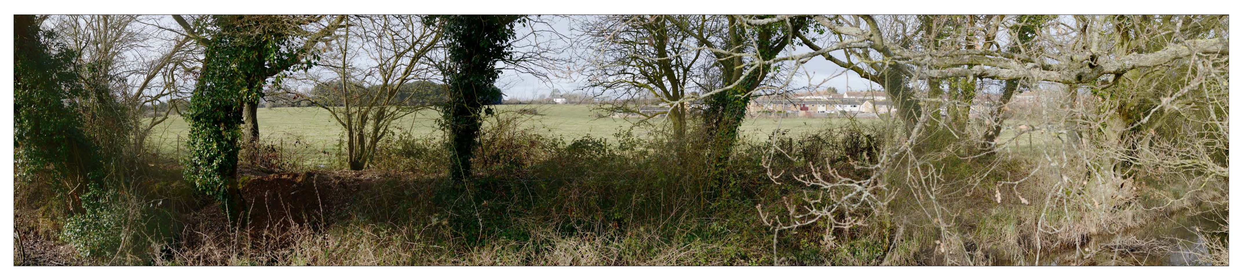
VIEWPOINT 10 (WINTER): VIEW WEST FROM FOOTPATH 48, EAST OF SITE