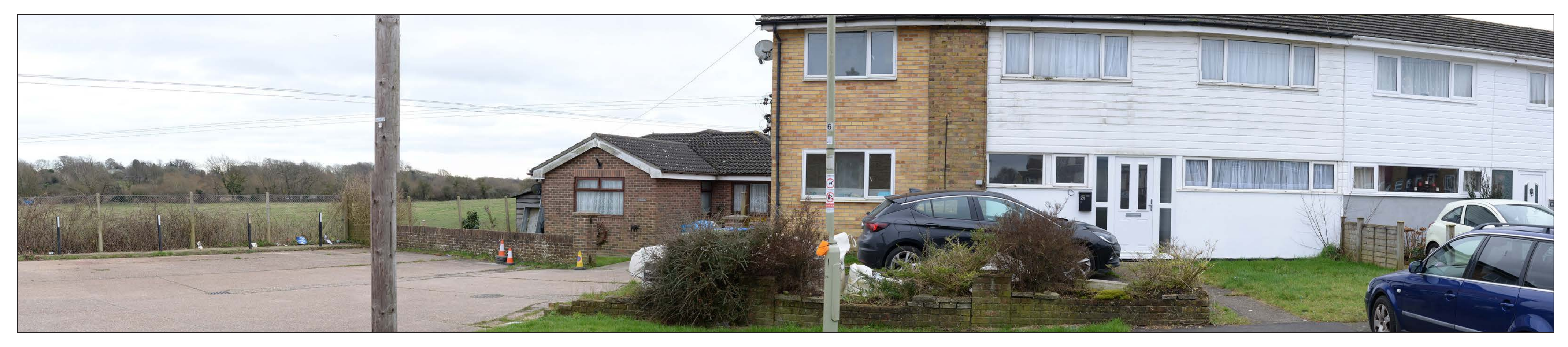
VIEWPOINT 9A (WINTER): VIEW SOUTH EAST FROM HEWETT CLOSE, TITCHFIELD