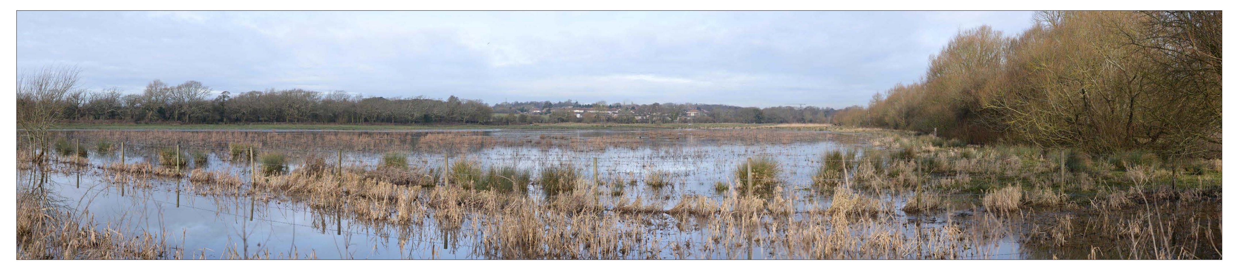
VIEWPOINT 13 (WINTER): VIEW NORTH WEST FROM FOOTPATH CROSSING RIVER MEON, WITHIN NATIONAL NATURE RESERVE