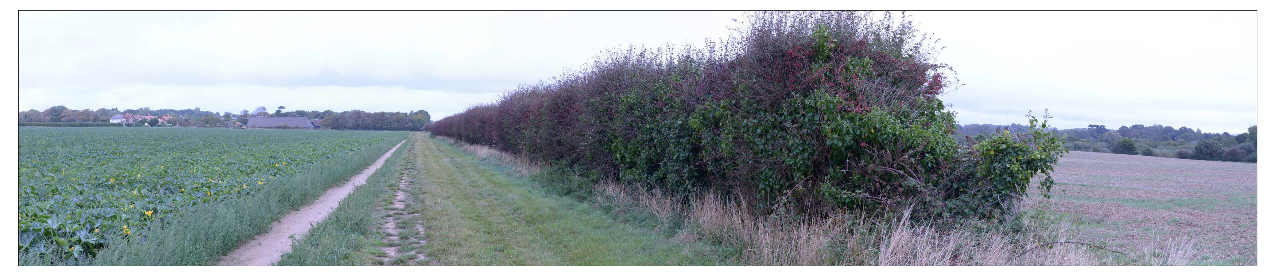
VIEWPOINT 8 (SUMMER): VIEW NORTH FROM FOOTPATH 34 NORTH OF UPPER FARM

The photographs within this sheet have been scaled to match the equivalent view of the human eye, when printed out at A2 and viewed at a distance of 300mm