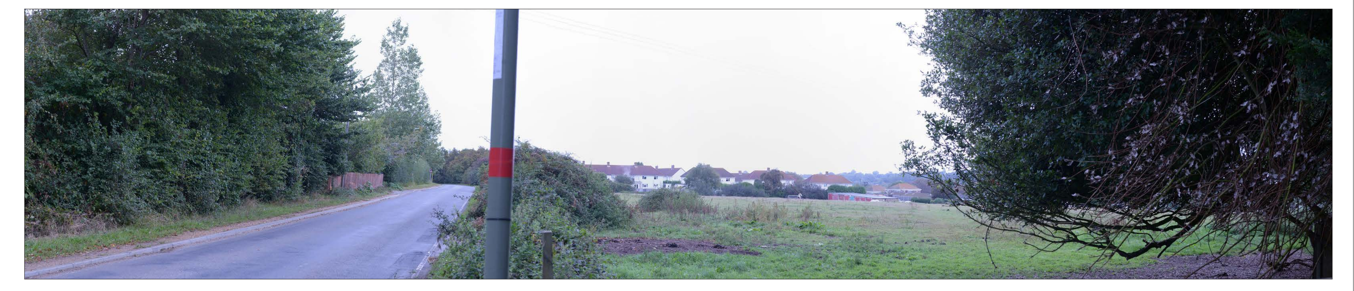
VIEWPOINT 3 (SUMMER): VIEW NORTH EAST FROM POSBROOK LANE AT JUNCTION WITH FOOTPATH 39

The photographs within this sheet have been scaled to match the equivalent view of the human eye, when printed out at A2 and viewed at a distance of 300mm.