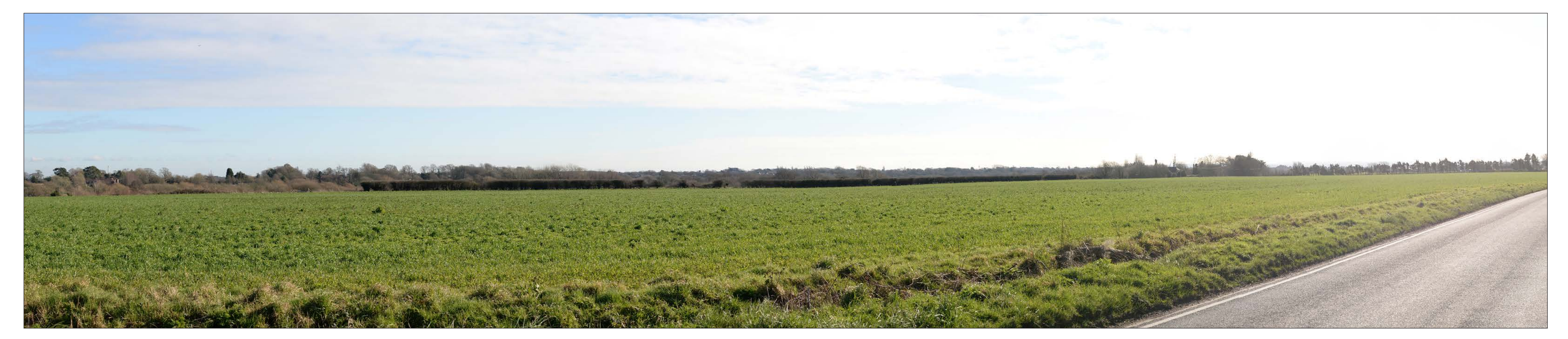
VIEWPOINT 5B (WINTER): VIEW EAST OFF POSBROOK LANE AT SOUTHERN GATEWAY TO TITCHFIELD

The photographs within this sheet have been scaled to match the equivalent view of the human eye, when printed out at A2 and viewed at a distance o