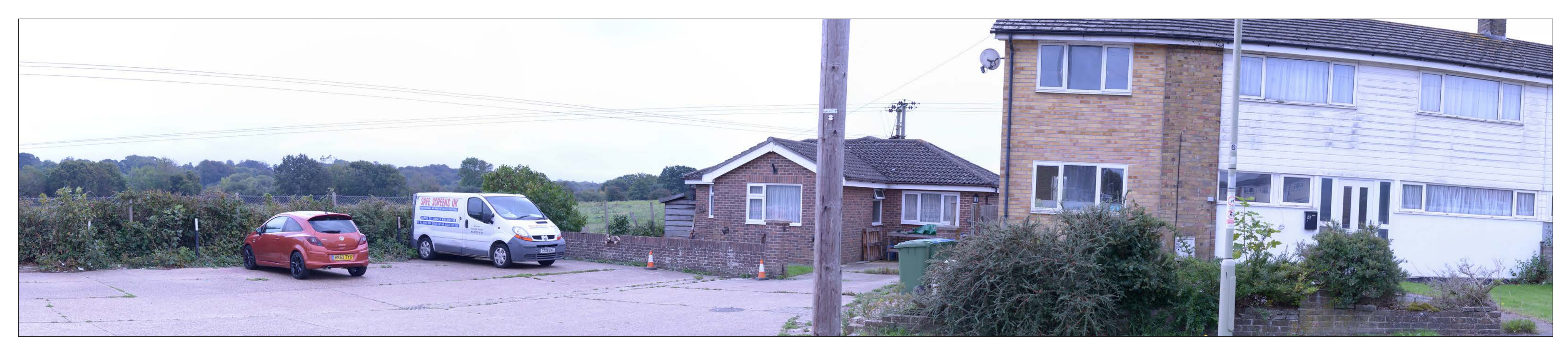
VIEWPOINT 9A (SUMMER): VIEW SOUTH EAST FROM HEWETT CLOSE, TITCHFIELD