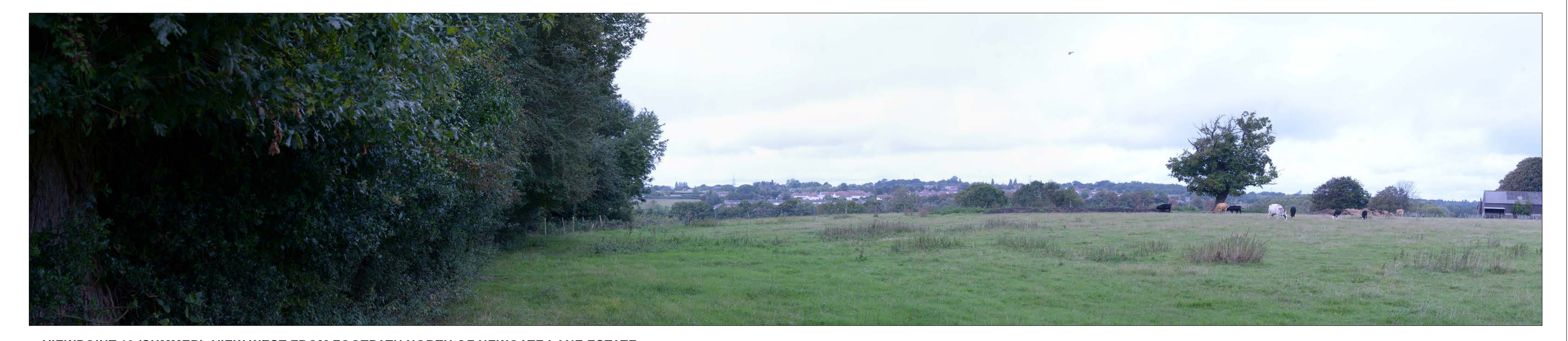
VIEWPOINT 12 (SUMMER): VIEW WEST FROM FOOTPATH NORTH OF NEWGATE LANE ESTATE

The photographs within this sheet have been scaled to match the equivalent view of the human eye, when printed out at A2 and viewed at a distance of 300mm.