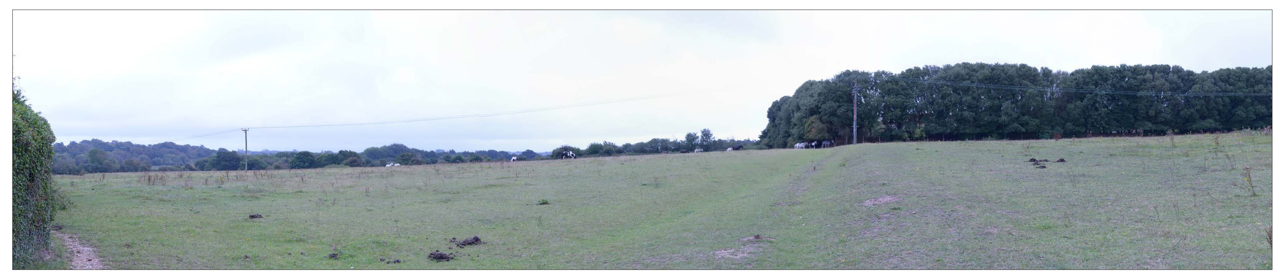
VIEWPOINT 1A (SUMMER): VIEW SOUTH EAST FROM FOOTPATHS 39 AND 34, EDGE OF BELLFIELD