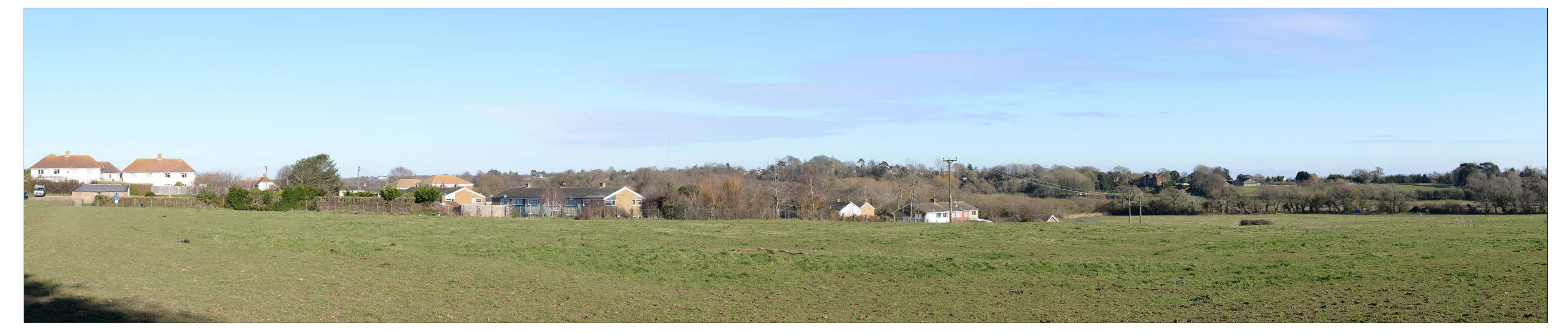
VIEWPOINT 2B (WINTER): VIEW NORTH EAST FROM FOOTPATH 34, CENTRE OF SITE