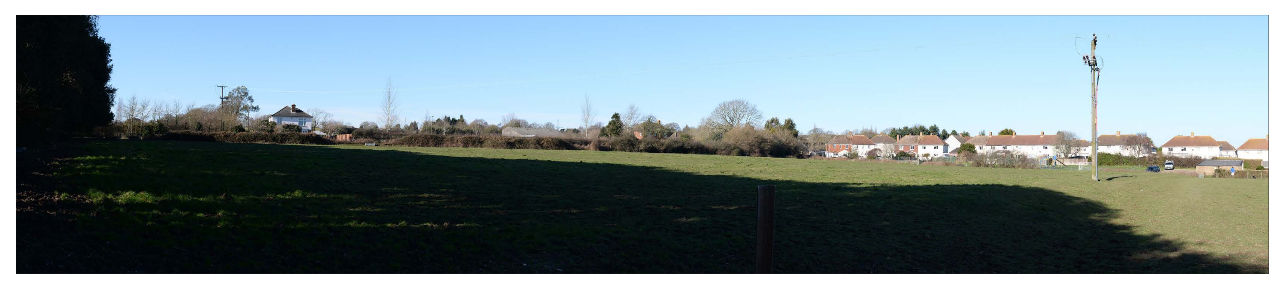
VIEWPOINT 2A (WINTER): VIEW NORTH WEST FROM FOOTPATH 34, CENTRE OF SITE