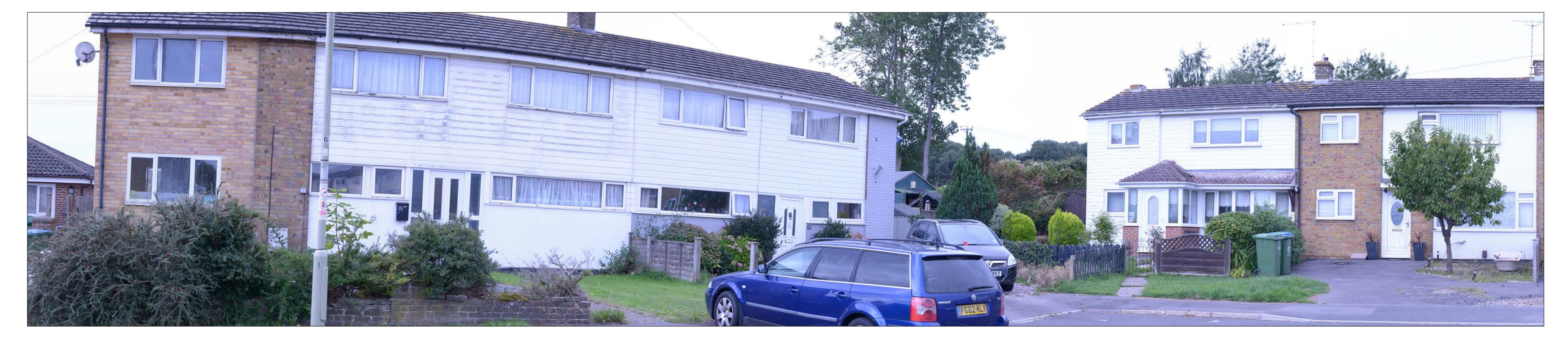
VIEWPOINT 9B (SUMMER): VIEW SOUTH WEST FROM HEWETT CLOSE, TITCHFIELD

The photographs within this sheet have been scaled to match the equivalent view of the human eye, when printed out at A2 and viewed at a distance of 300mm.