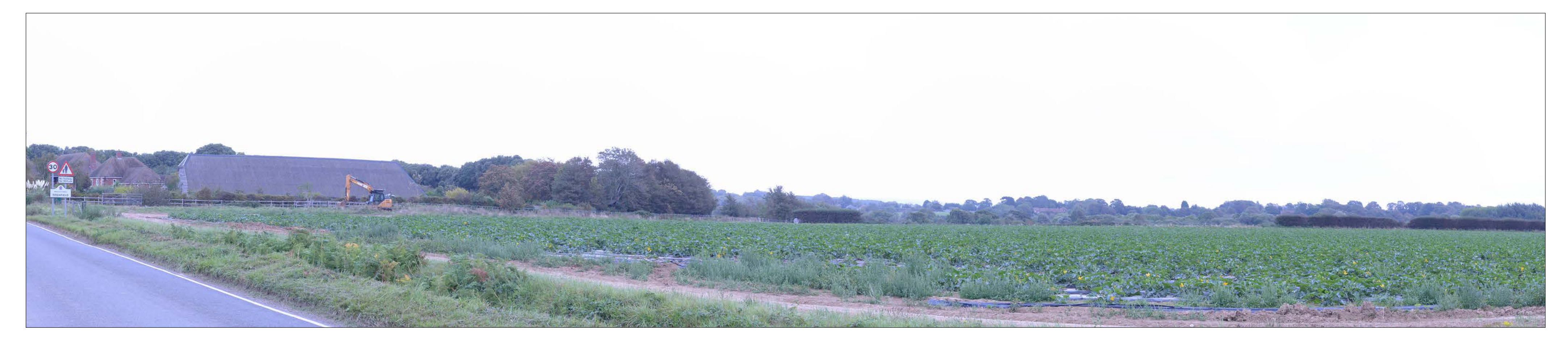
VIEWPOINT 5B (SUMMER): VIEW EAST OFF POSBROOK LANE AT SOUTHERN GATEWAY TO TITCHFIELD

The photographs within this sheet have been scaled to match the equivalent view of the human eye, when printed out at A2 and viewed at a distance of 300mm.