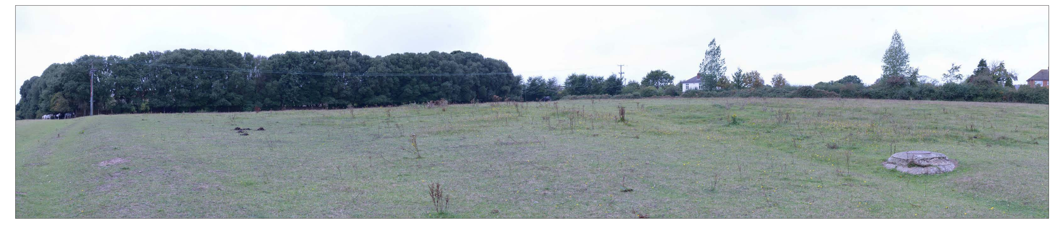
VIEWPOINT 1B (SUMMER): VIEW SOUTH WEST FROM FOOTPATHS 39 AND 34, EDGE OF BELLFIELD