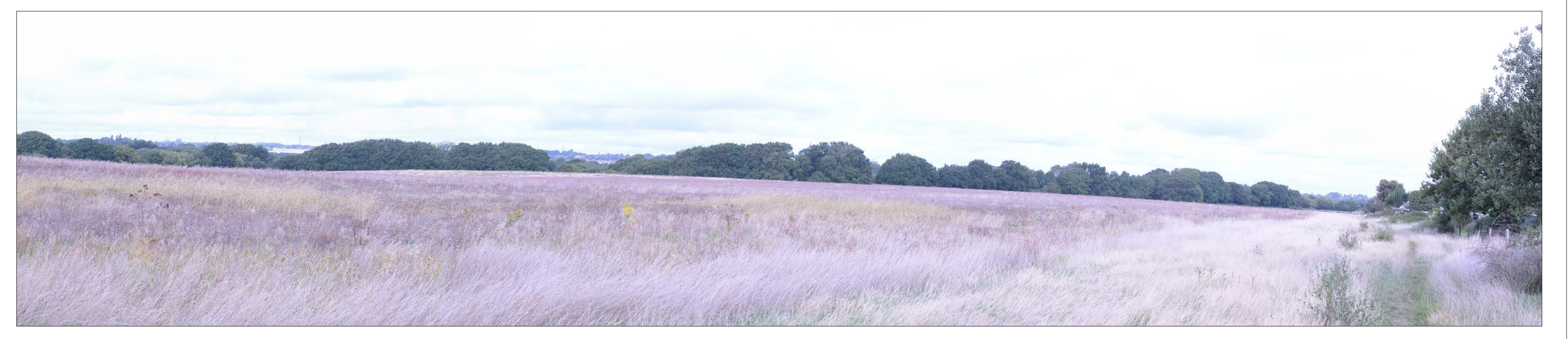
VIEWPOINT 14 (SUMMER): VIEW NORTH WEST FROM FOOTPATH ON NORTHWESTERN EDGE OF STUBBINGTON