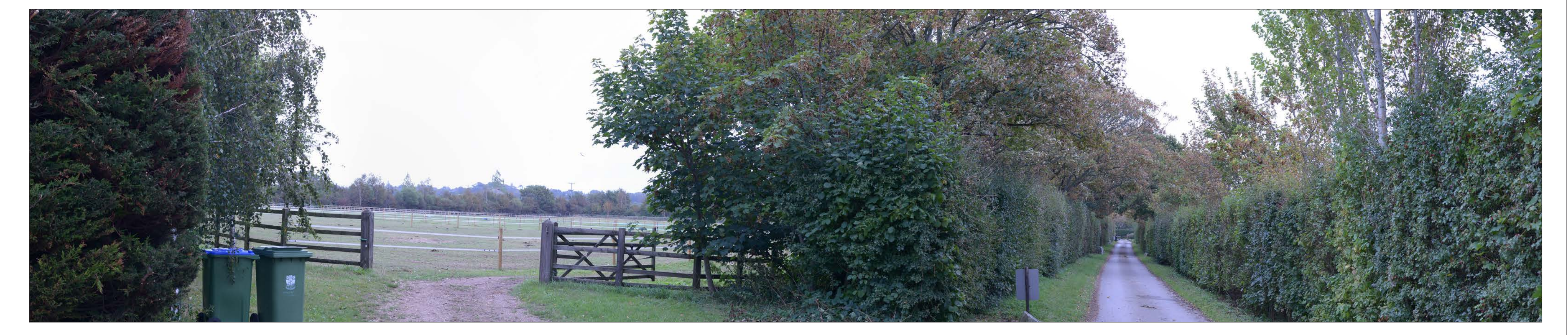
VIEWPOINT 4 (SUMMER): VIEW EAST FROM FOOTPATH WEST OF POSBROOK LANE

The photographs within this sheet have been scaled to match the equivalent view of the human eye, when printed out at A2 and viewed at a distance of 300mm.