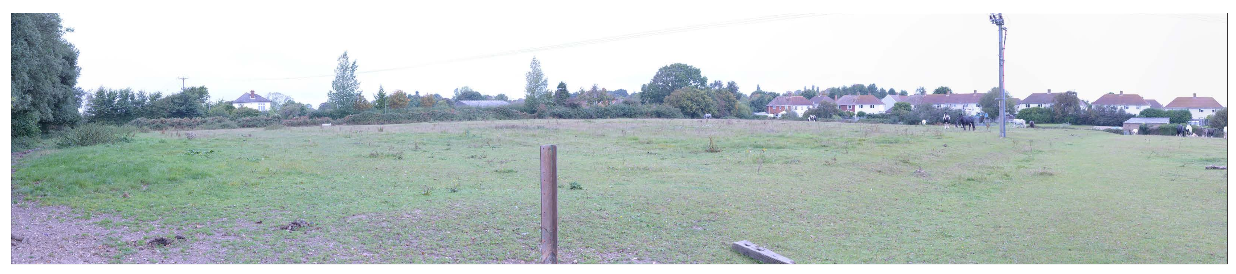
VIEWPOINT 2A (SUMMER): VIEW NORTH WEST FROM FOOTPATH 34, CENTRE OF SITE