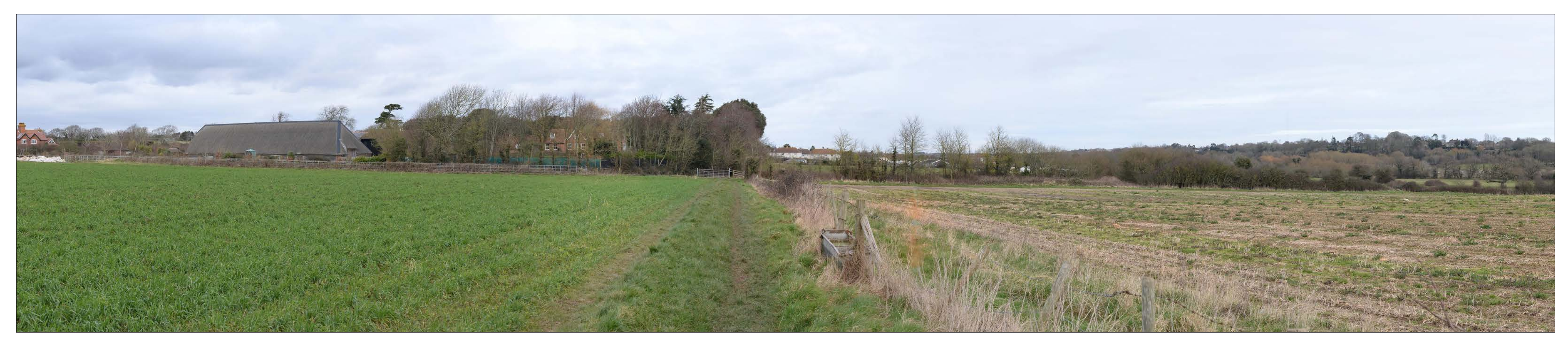
VIEWPOINT 7 (WINTER): VIEW NORTH FROM FOOTPATH 34 SOUTH OF GREAT POSBROOKE FARM