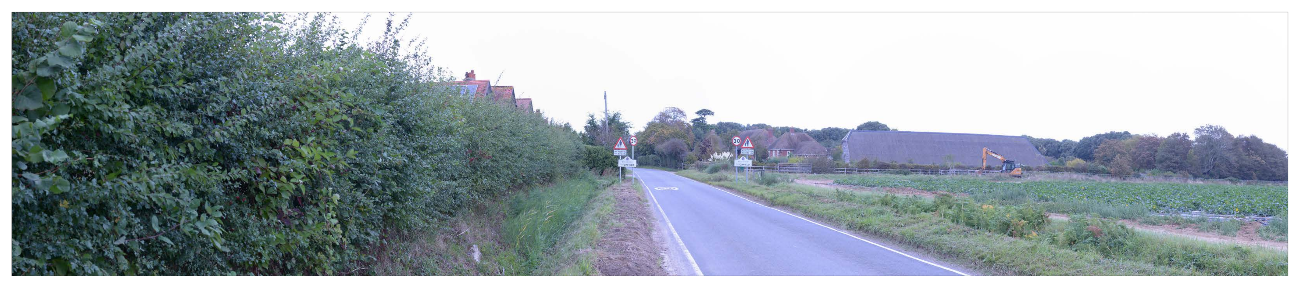
VIEWPOINT 5A (SUMMER): VIEW NORTH OFF POSBROOK LANE AT SOUTHERN GATEWAY TO TITCHFIELD