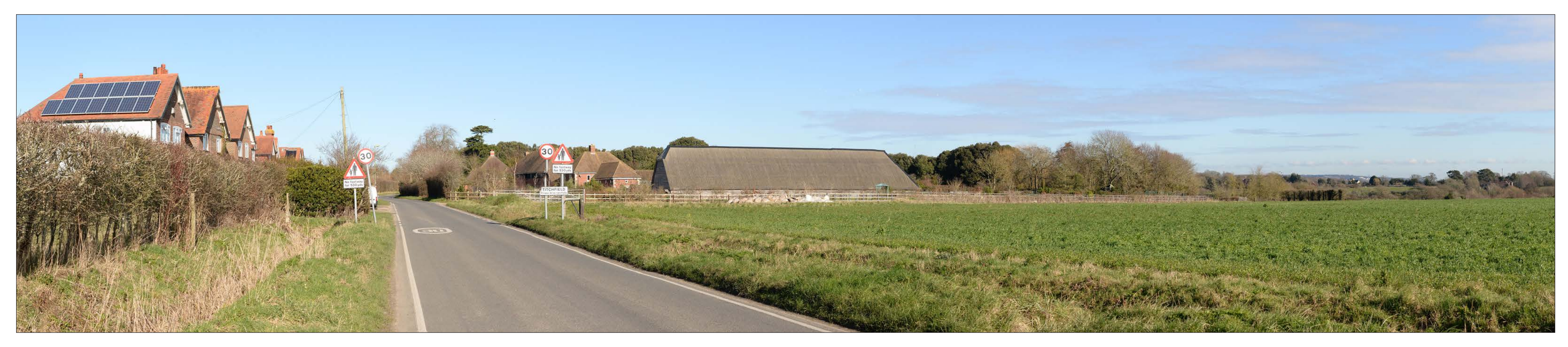
VIEWPOINT 5A (WINTER): VIEW NORTH OFF POSBROOK LANE AT SOUTHERN GATEWAY TO TITCHFIELD