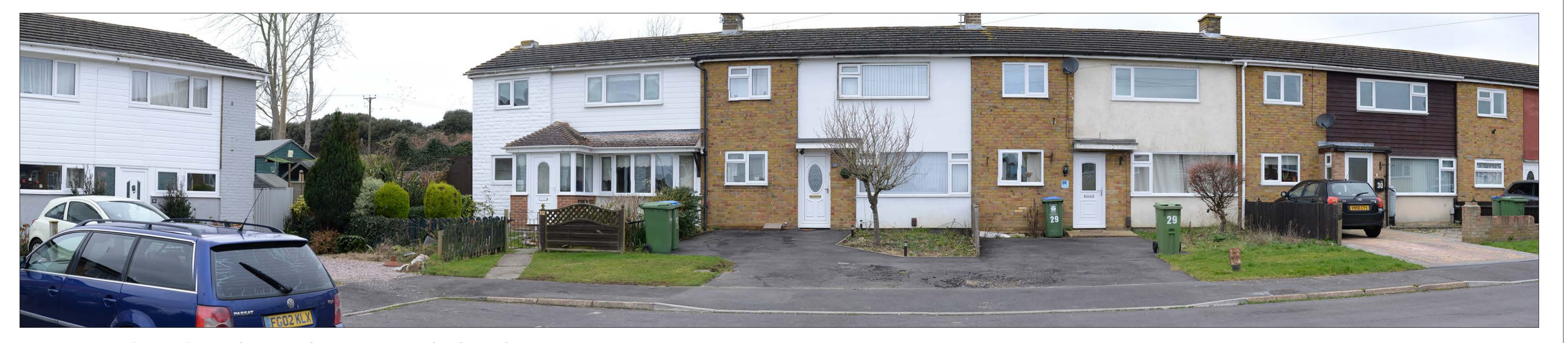
VIEWPOINT 9B (WINTER): VIEW SOUTH WEST FROM HEWETT CLOSE, TITCHFIELD

The photographs within this sheet have been scaled to match the equivalent view of the human eye, when printed out at A2 and viewed at a distance of 300mm.