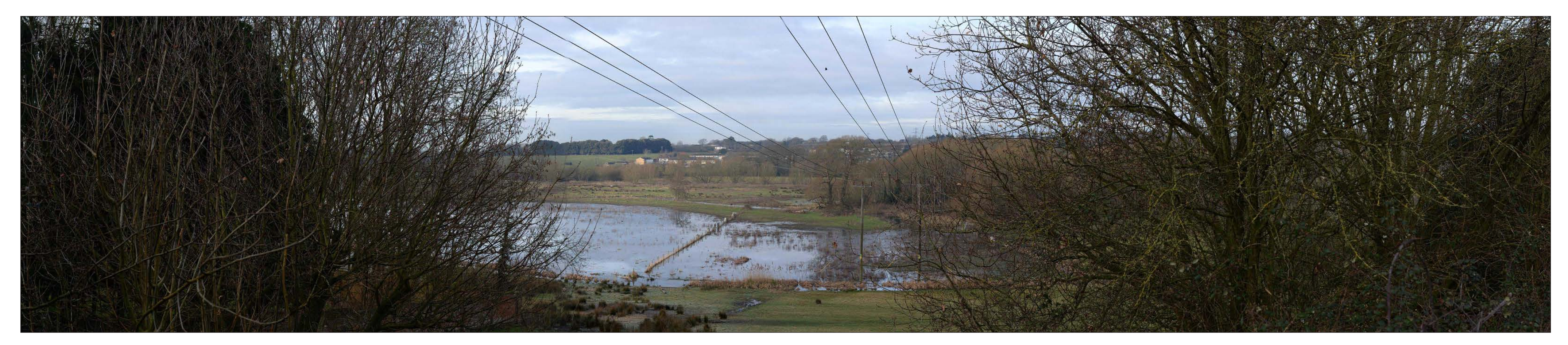
VIEWPOINT 11 (WINTER): VIEW WEST FROM TITCHFIELD ROAD, NORTH OF HOLLAM HOUSE