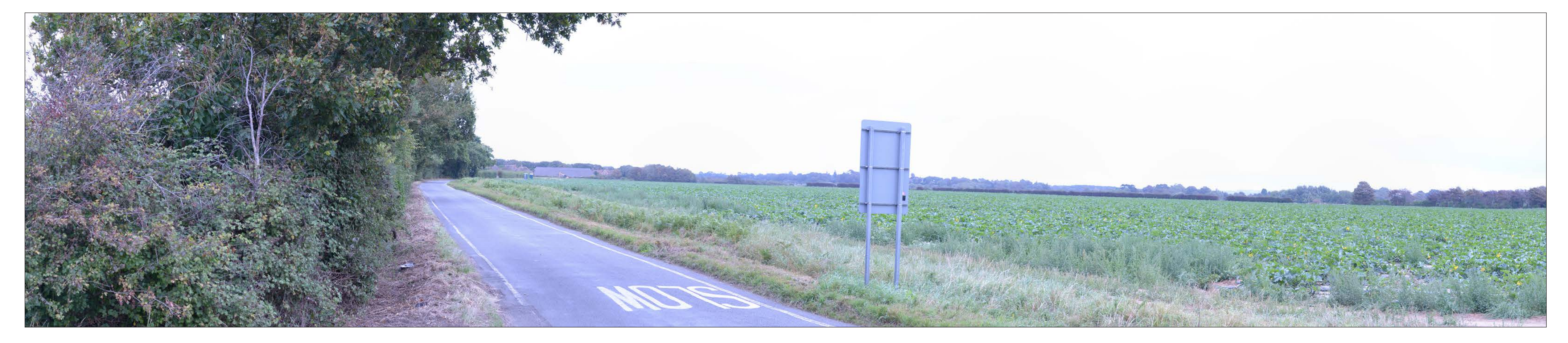
VIEWPOINT 6 (SUMMER): VIEW NORTH OFF POSBROOK LANE NORTH OF SINGLEDGE HOUSE

The photographs within this sheet have been scaled to match the equivalent view of the human eye, when printed out at A2 and viewed at a distance of 300m