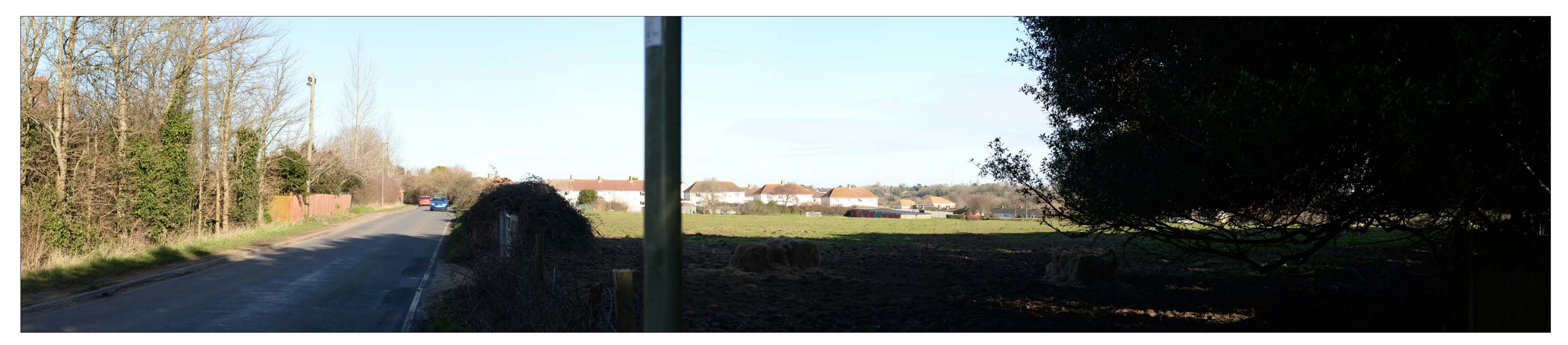
VIEWPOINT 3 (WINTER): VIEW NORTH EAST FROM POSBROOK LANE AT JUNCTION WITH FOOTPATH 39