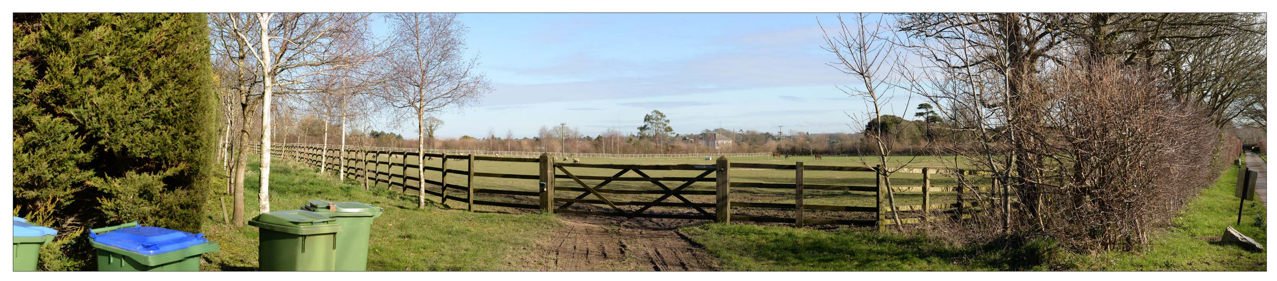
VIEWPOINT 4 (WINTER): VIEW EAST FROM FOOTPATH WEST OF POSBROOK LANE