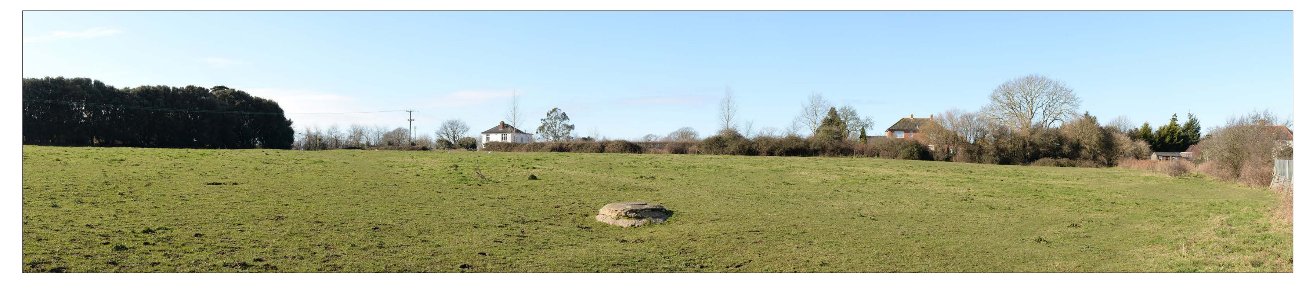
VIEWPOINT 1B (WINTER): VIEW SOUTH WEST FROM FOOTPATHS 39 AND 34, EDGE OF BELLFIELD